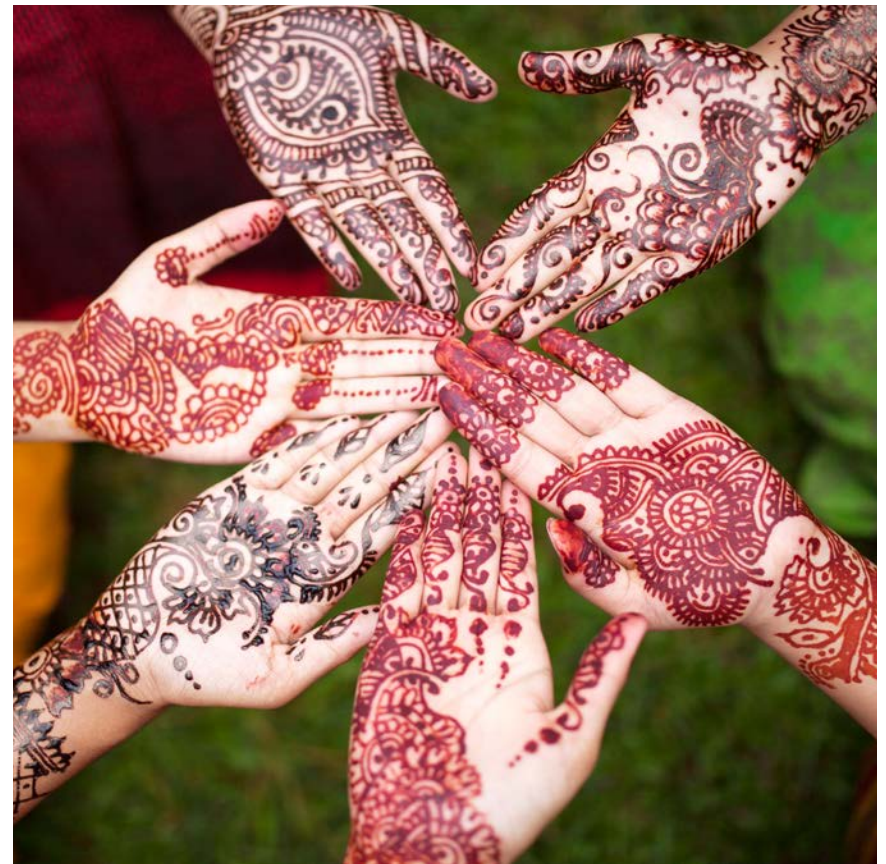
Henna from the henna bush is used to decorate hands in many countries.

Most paper is made from trees. Other kinds of paper are made from rice and bamboo. Rubber was first made from the sap of rubber trees.