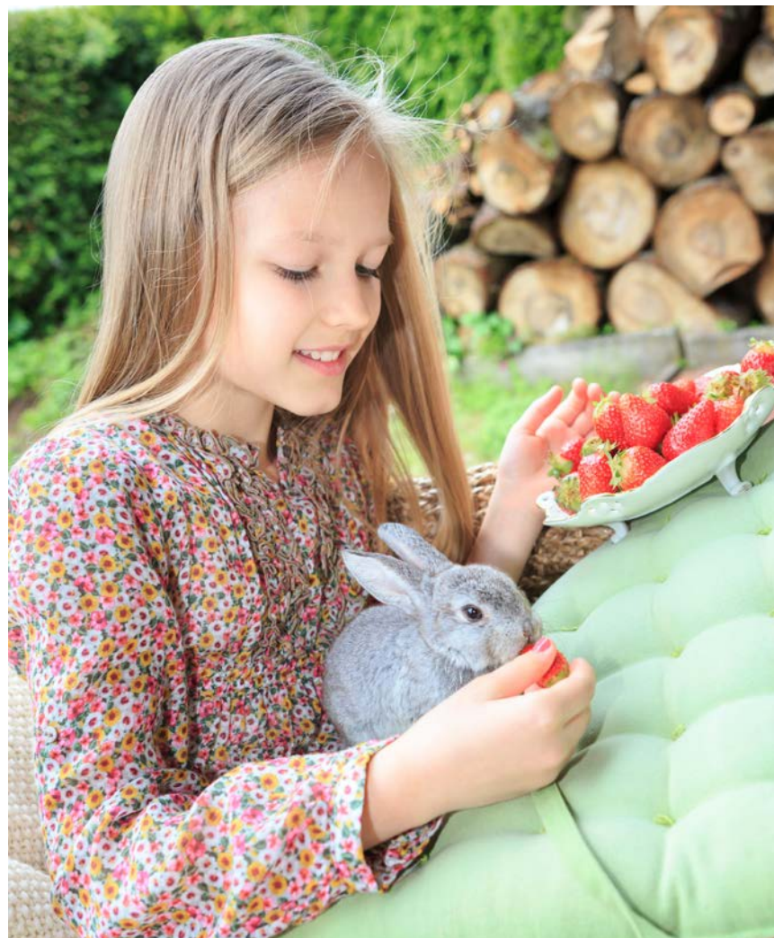
A girl and her rabbit both enjoy strawberries.