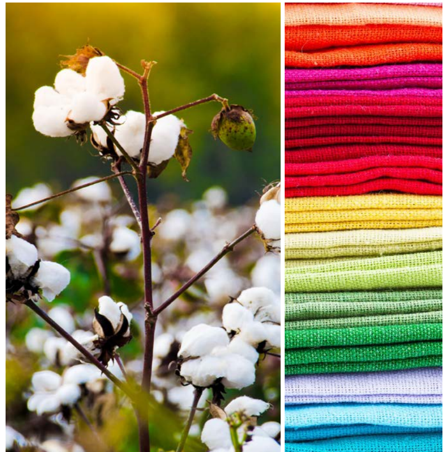
Cotton (left) and linen (right) both come from plants.

Oil, coal, and gas can also be burned for heat or used to run cars. Oil, coal, and gas come from plants and animals that died long ago.