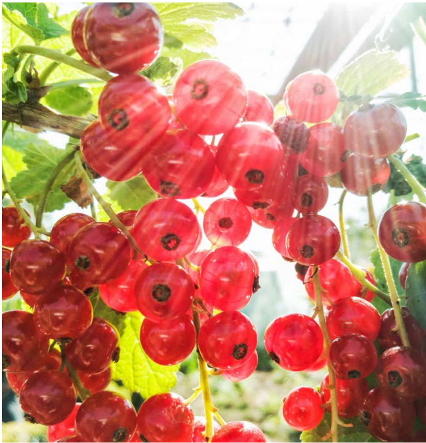
Fruits are full of energy from the sun.