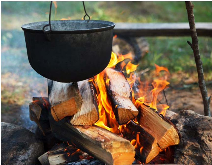
Wood makes a good fuel for cooking.