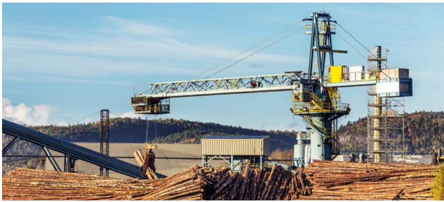
A paper mill turns logs into paper.