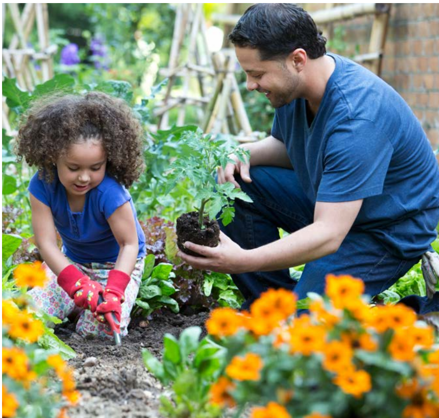
A garden can be a fun way to see what comes from plants.