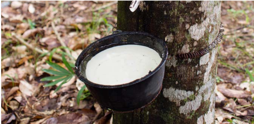
Latex is a white milky liquid that comes from rubber trees. It can be used to make rubber.