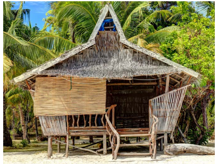
This house is made from many different plant parts.